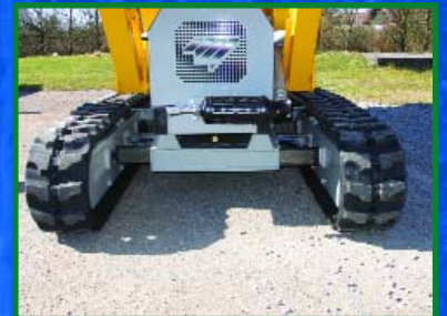
Standard Variable Width Undercarriage